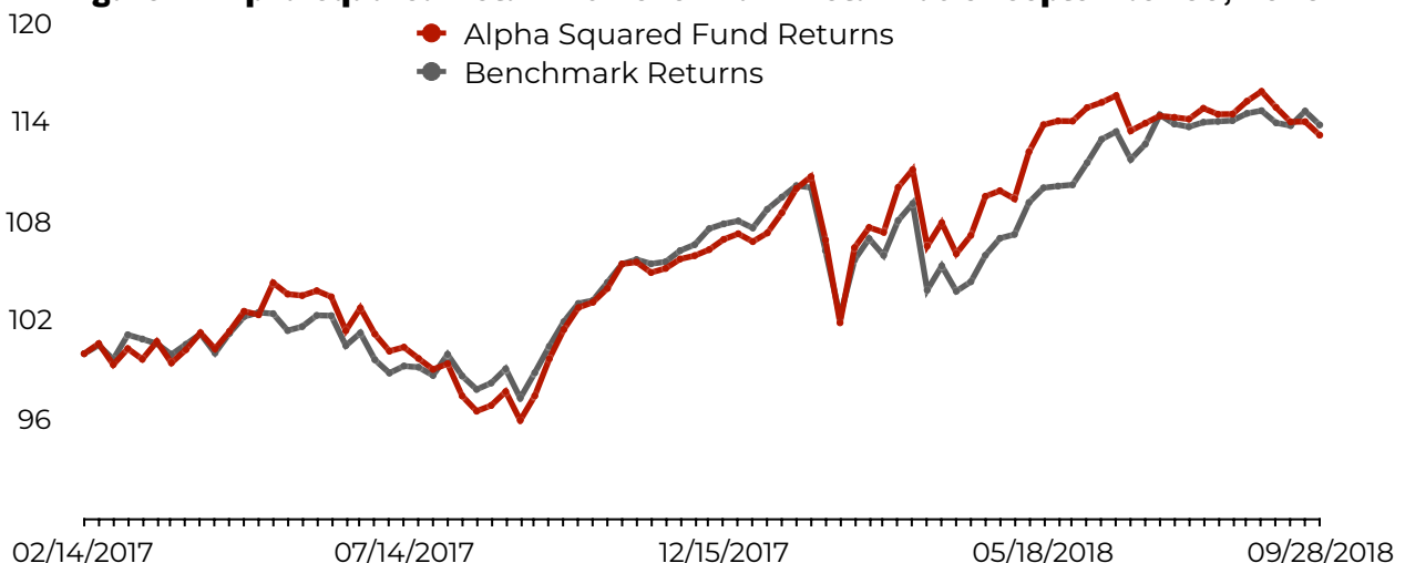
Figure 2: Alpha Squared Return vs Benchmark Return as of September 30, 2018

Note: Performance is calculated gross of fees. Benchmark is a blended 60% S&P TSX and 40% S&P 500 (measured in CAD). Inception date was February 14, 2017.